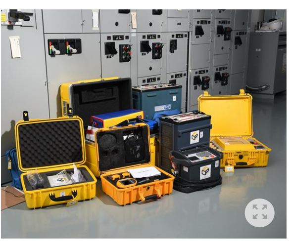
ECP Solutions Equipment 2