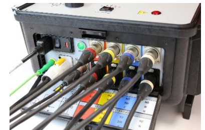
TTRU3 3Ø Universal Leads (5/10/20/30m)