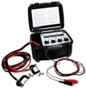
Hand Crank TTR 1Ø 2.5m Leads