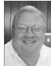
by Lynn Hamrick ESCO Energy Services Company

Following the Occupational Health and Safety Act of 1970, OSHA adopted the 1968, and then the 1971, edition of NFPA 70, National Electric Code , under Section 6(a) of the Act. Subsequent changes or additions to the OSHA requirements would require performing the process outlined in Section 6(b) of the Act, which requires a public notice or an opportunity for public comment and public hearings. This is an expensive and lengthy process at best. Unfortunately, OSHA found that the NEC was lacking in many aspects of electrical safety. The NEC primarily deals with the design and construction of electrical installations. However, OSHA's responsibilities include the employers and employees in the workplace, and the NEC does not address the requirements for electrical safety-related work practices associated with the operation and maintenance of electrical systems. Realizing this difference, the National Fire Protection Association (NFPA) offered its assistance in preparing a document "to assist OSHA in preparing electrical safety standards that would serve