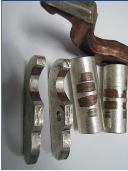
Figure 2 — Metal-to-Metal Wear Caused by Lack of Maintenance

Many production people believe that no news is good news or don't fix it if it isn't broken. Would these same people run their cars 100,000 miles and not change the oil? Well, maybe some of them would try. They would find out that the blown and seized engine costs much more than what was saved on skipped oil changes. So why do some people have such a difficult time applying that same lesson to electrical equipment?