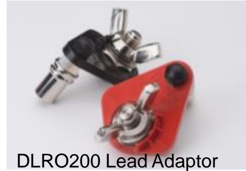
DLRO200 Lead Adaptor