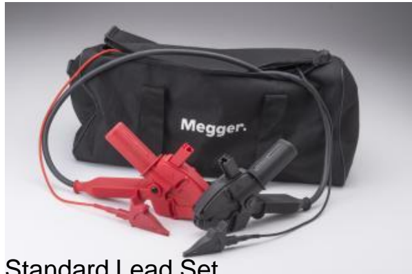
Standard Lead Set