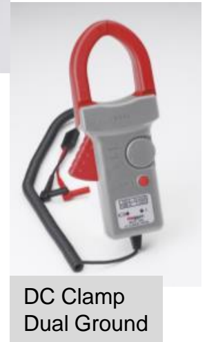
DC Clamp Dual Ground