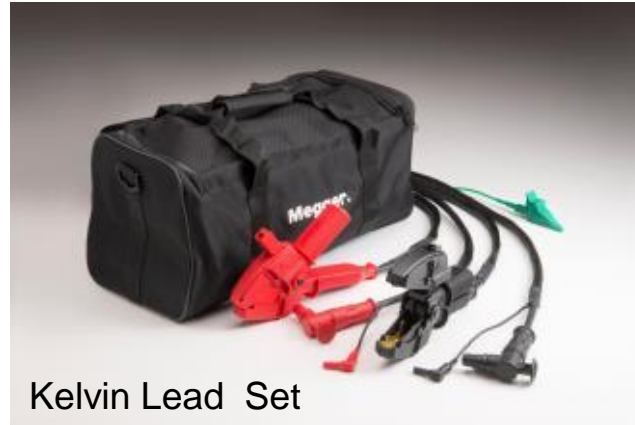
Kelvin Lead Set